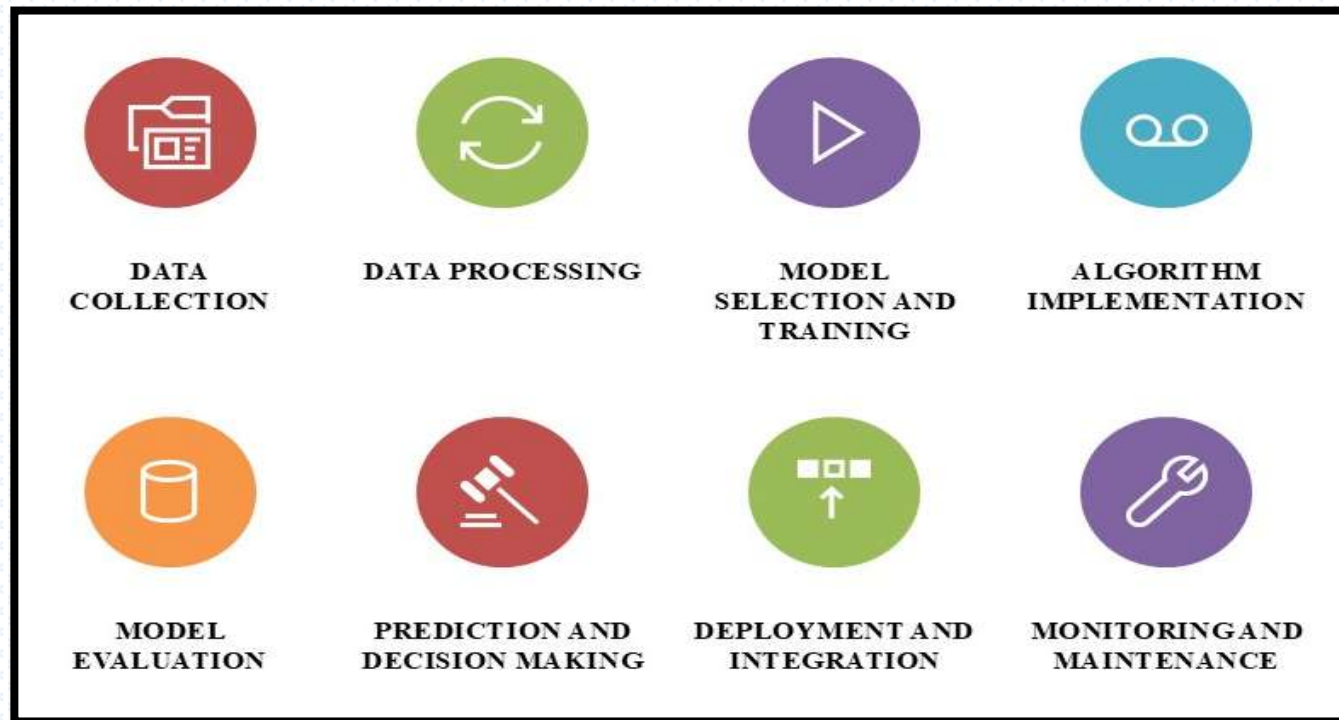
Fig. 1. Photograph showing the Artificial Intelligence workflow

The process of the AI can be represented by following diagram: