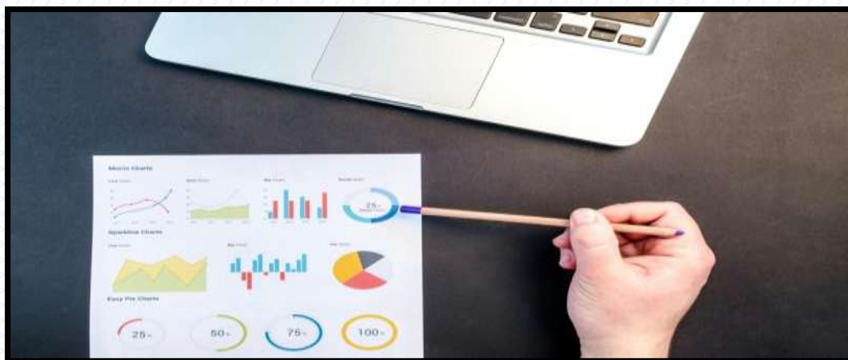
Fig. 3 Advantages of AI in Biotech and Medical Science